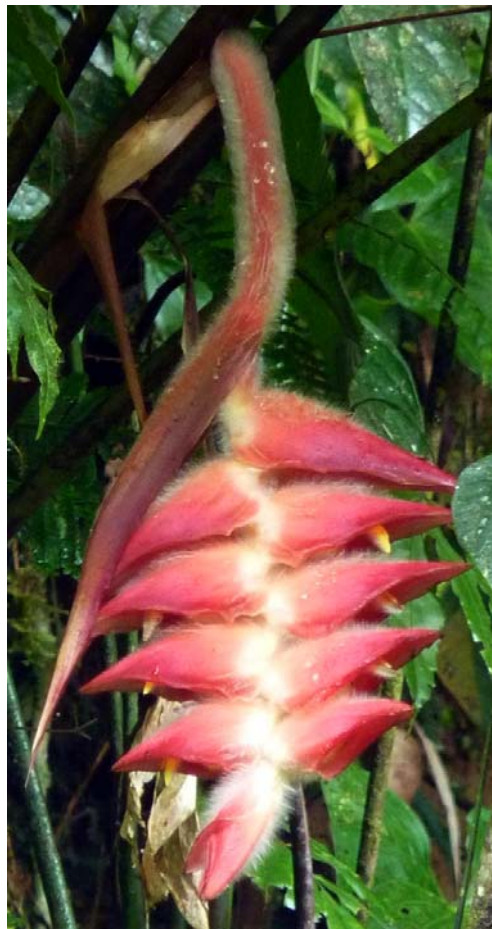
Unidentified Heliconia sp.