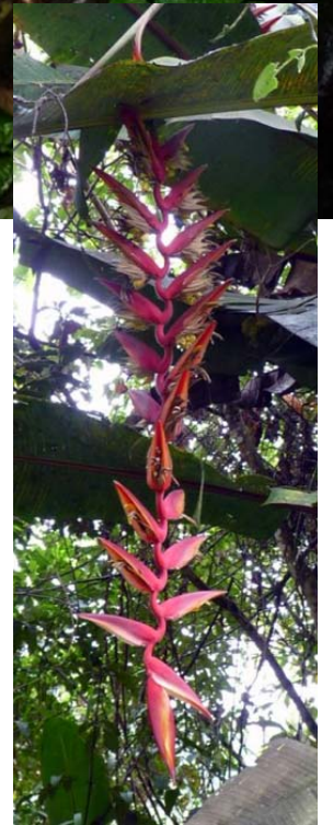
Red form of Heliconia griggsiana .