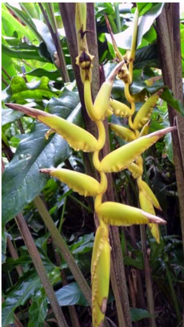
Unidentified Heliconia sp.