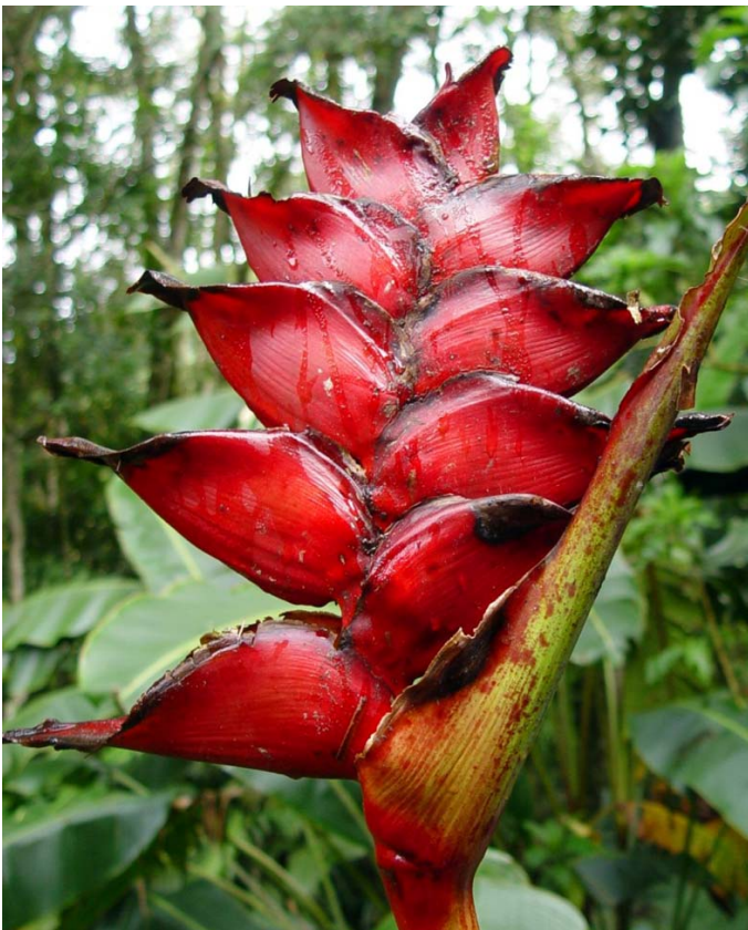
Heliconia sp. 'Rojona'

Calathea burle-marxii 'Blue Ice', Musa coccinia , white Alpinia purpurata , and many different kinds of bromeli-