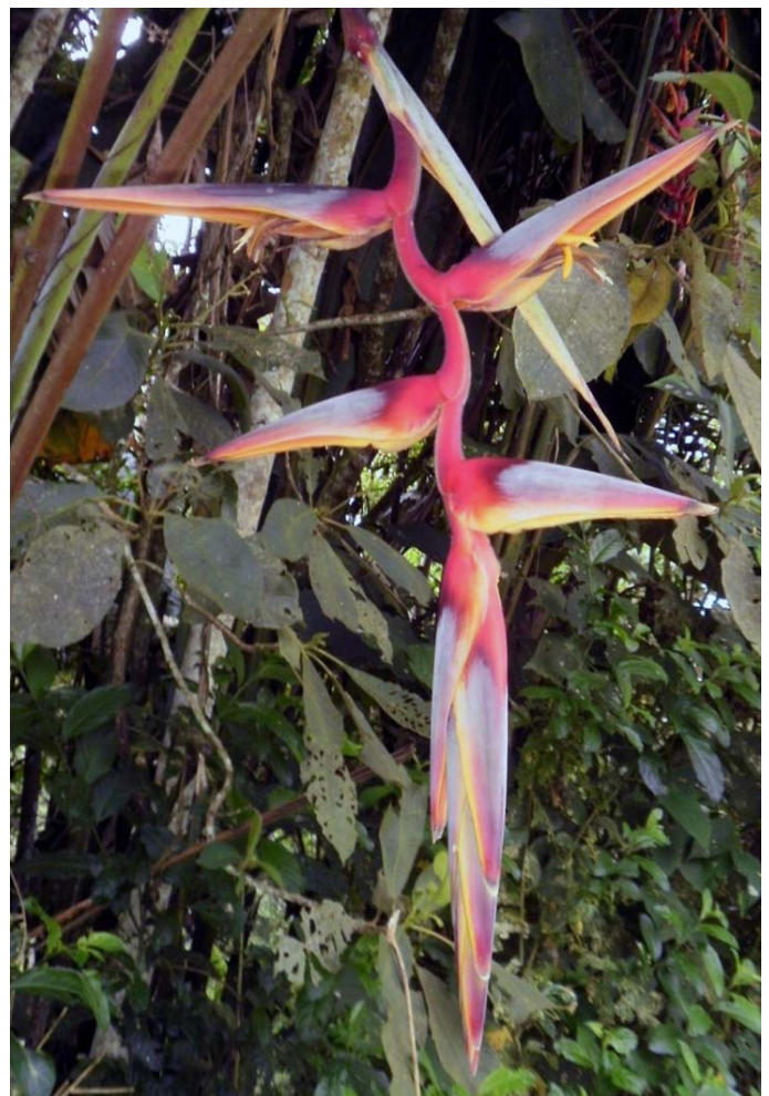
The beautiful Colombian species Heliconia gigantea .