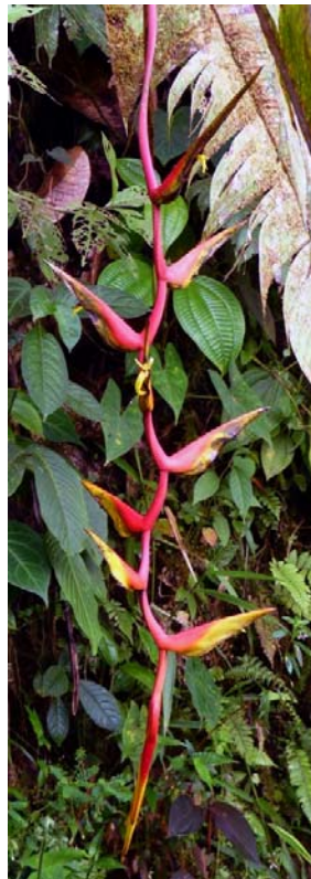
Heliconia spiralis 'Anchicayá'