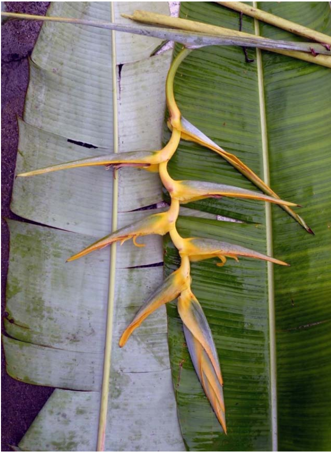
A beautiful green and gold form of Heliconia griggsiana .