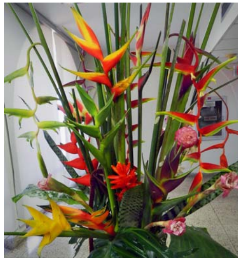
Beautiful floral arrangement featuring heliconias, gingers, and ornamental bananas.